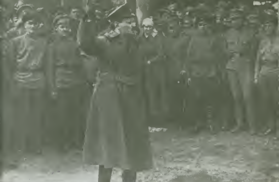
Trotsky addresses a contingent of the Red Army which he ultimately built up to a force of five million men.

Trotsky was purged from the Russian Government by Stalin and fled to Mexico to escape assassination. Although Trotsky lived under constant guard, a killer finally got through to him in August, 1940, and smashed his skull with an alpenstock.