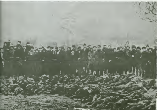
Bolshevik atrocities. Fifty bodies of community leaders of Wesenberg are exhumed from a lake after being shot and mutilated in reprisal for the death of two Communists.