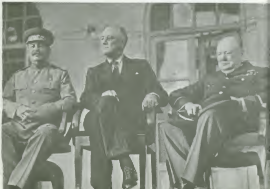
One of the meetings of President Roosevelt, Premier Stalin and Prime Minister Churchill. This one was held at Teheran during one of the most critical periods of World War II.