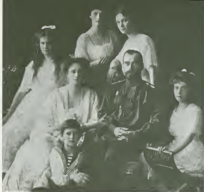
Tsar Nicholas II and his family in their days of power. At the feet of the Empress is the Tsarevitch. Back row: Grand Duchesses, Anastasia, Titiana and Olga; Marie is at her Father's left.

A successful attempt by the Russian Provisional Government to put down a Communist uprising in Petrograd during July, 1917. As a result of this Communist defeat, Lenin fled to save his life.