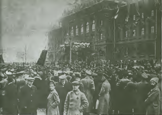
First Russian photo of the Bolshevik revolution to reach the United States. This shows victorious Communist leaders addressing a large crowd in Moscow after seizure of power.