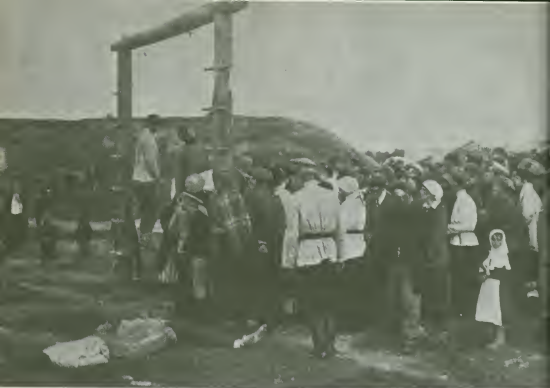
White Russians retaliate by hanging suspected Bolsheviks. During the Civil War several million lost their lives.