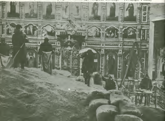
Bolsheviks use a confiscated church for a wheat granary. This was part of the Red campaign to discourage religious worship.