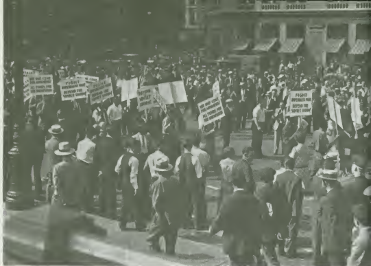
A common sight in New York during the Nineteen Thirties when American Communists paraded through the streets with their familiar slogan: "Defend the Soviet Union."